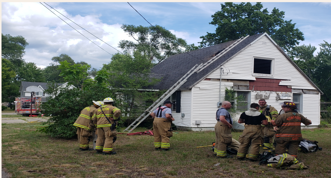
Montrose Township Fire Department training at a city owned property with other neighboring fire departments in 2020.

This ballot proposal is a renewal and is not a new millage. If renewed this millage would continue to be a dedicated source of revenue to fund police and fire protection services. This revenue offsets the cost of the public safety contract that provides funding for Montrose Township firefighters and police officers including wages, benefits, supplies, equipment and training.